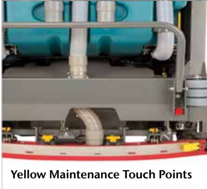
Yellow Maintenance Touch Points

Overhead guard protects operators from falling objects.