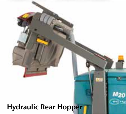
Hydraulic Rear Hopper