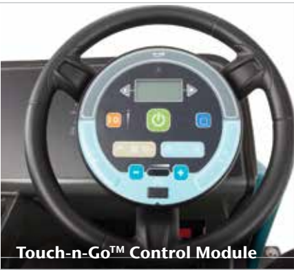
Touch-n-Go™ Control Module