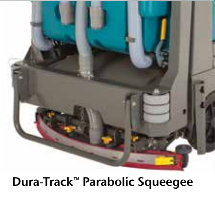
Dura-Track™ Parabolic Squeegee